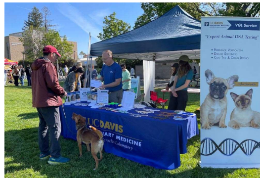
Photo caption: Staff and students volunteering at the VGL booth at Picnic Day.

One of the most anticipated events of the year, Picnic Day gives VGL a chance to fulfill its mission of promoting knowledge and education in animal genetics by meeting people of all ages that visit UC Davis on Picnic Day and exposing them to a bit of what we do. This year, VGL's wonderful volunteers offered three different activities: a DNA decoding activity that explained how DNA is read to make proteins in an easy and fun way; a horse coat color activity that explained how genes interact to produce some of the basic coat colors in horses; and a dog breeding activity that gave young visitors a chance to understand how traits are passed on from parent dogs to their puppies.