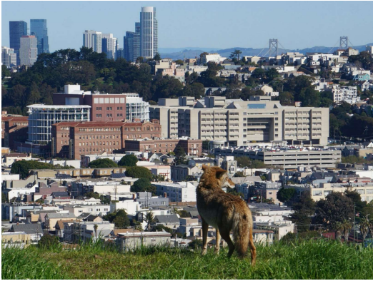
Photo caption: A coyote glancing at the city of San Francisco from the top of a hill.