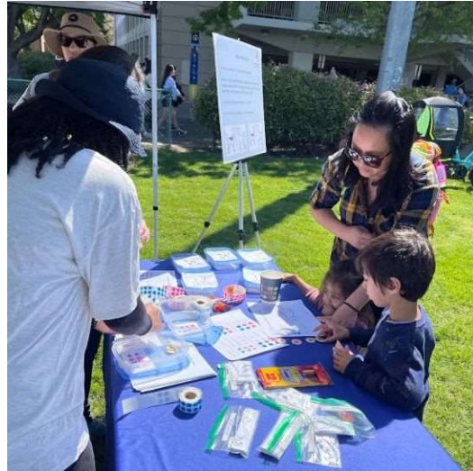
Photo caption: We had activities for all ages! VGL staff helps a young visitor understand the basics of inheritance with a dog breeding activity.